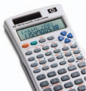
Dual Power: Solar and battery