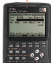
Communicate wirelessly through IrDA port

The HP 50g Graphing Calculator includes all the features of the HP 48gII plus: