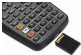
SD card slot for expanded memory and data transfer 1